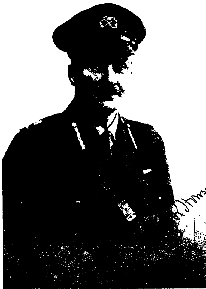
I. MAJOR-GENERAL SIR NEVILL R. HOWSE, DIRECTOR OF MEDICAL SERVICES, AUSTRALIAN IMPERIAL FORCE, 1915-19