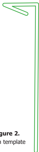
Figure 2. Stem template