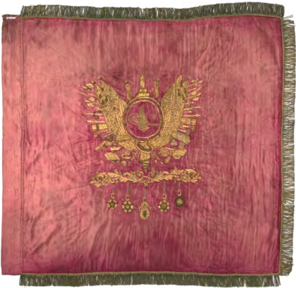
The heavily embroidered standard of the Turkish 46th regiment, captured by the Australian Light Horse near Damascus on 2 October 1918.