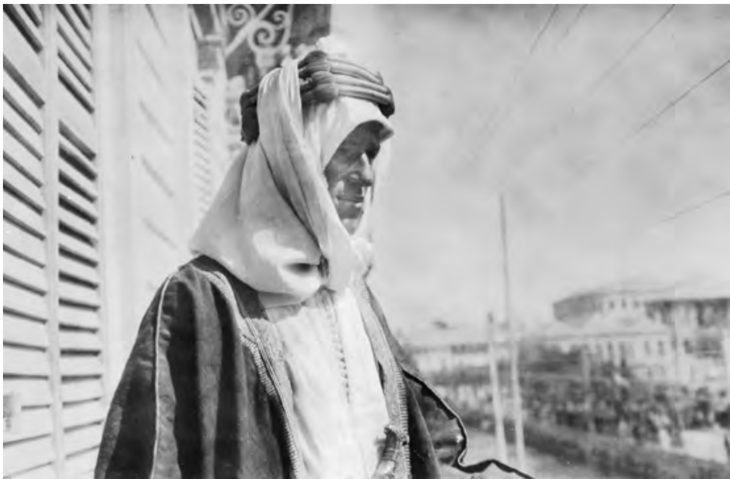
Lawrence on the balcony of the Victoria Hotel in Damascus. Just half an hour earlier he had resigned as adviser to Feisal. He was exhausted and sought Allenby's permission to return to London.