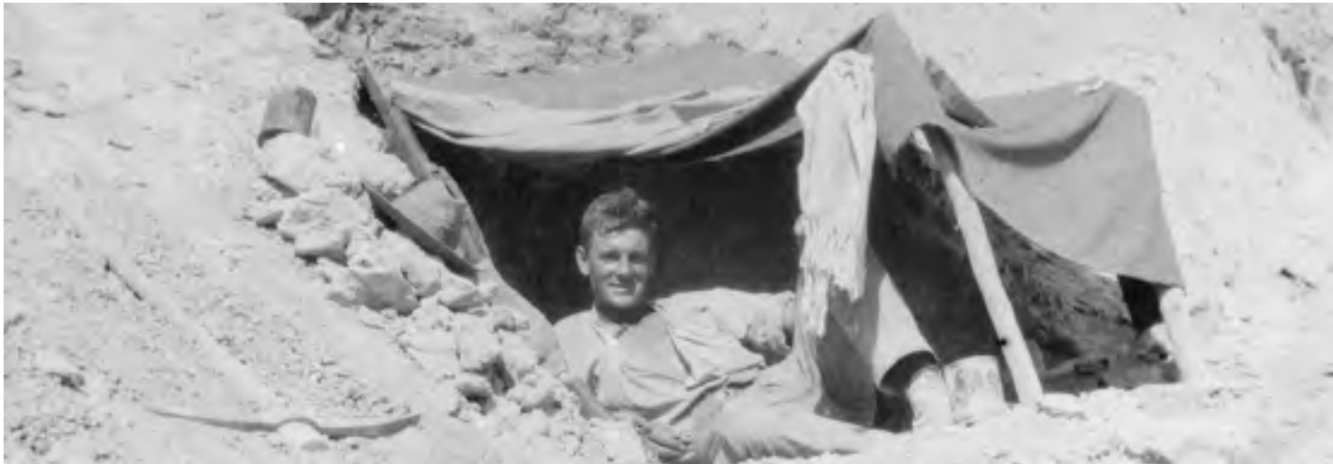
A light horseman camped on a hillside in the hot and inhospitable Jordan Valley during July 1918.