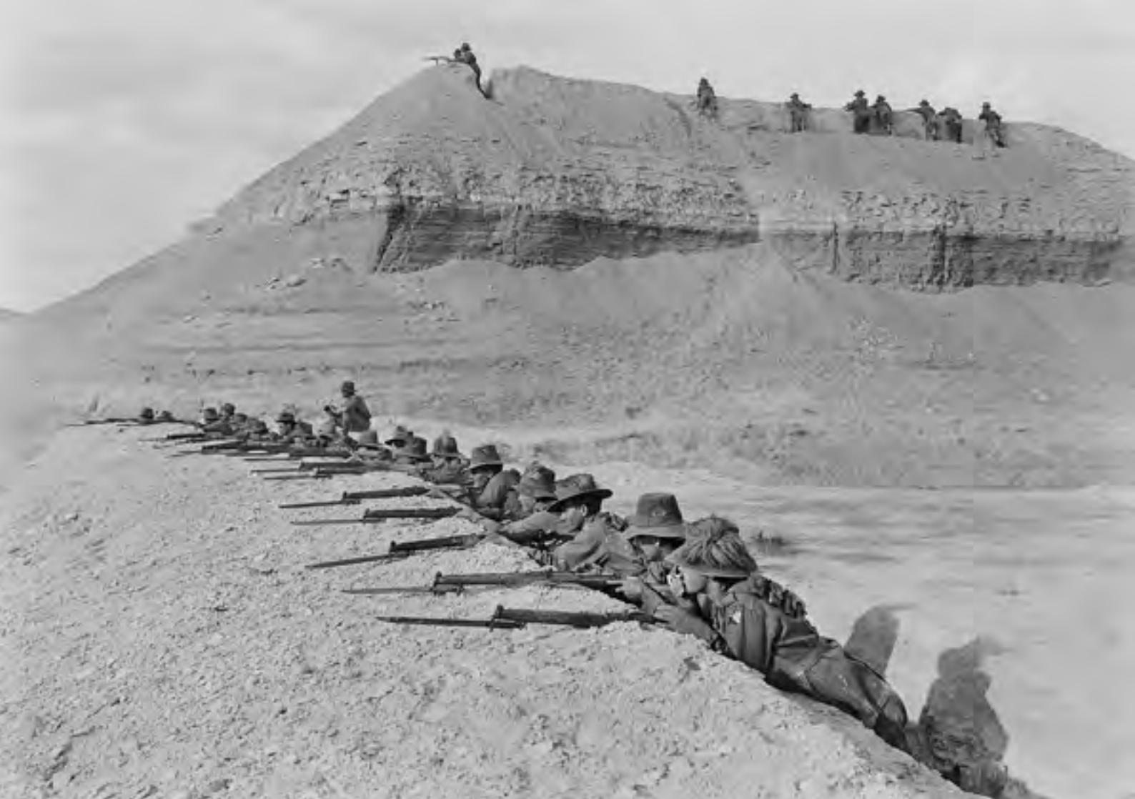
Troops of the 5th Light Horse Regiment holding the bridgehead at Ghoraniye, Palestine, in April 1918.