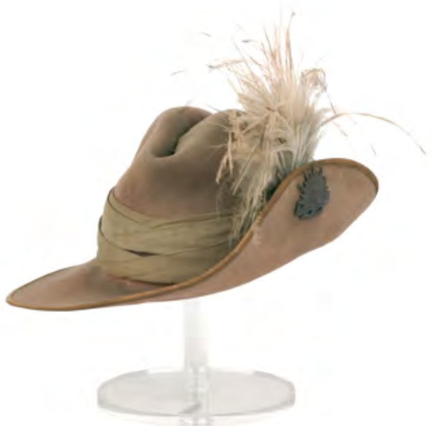
The emu-plumed slouch hat came to proudly symbolise the light horse, although not every regiment adopted the feathers.