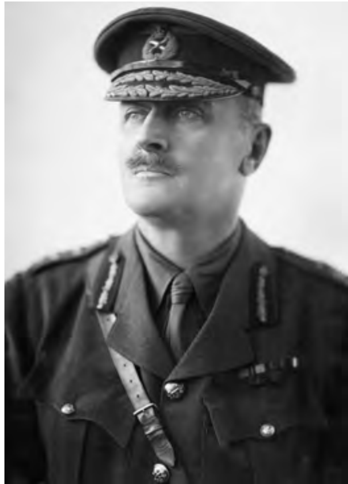
General Sir Edmund Allenby commanded the Egyptian Expeditionary Force from June 1917 until the war's end.