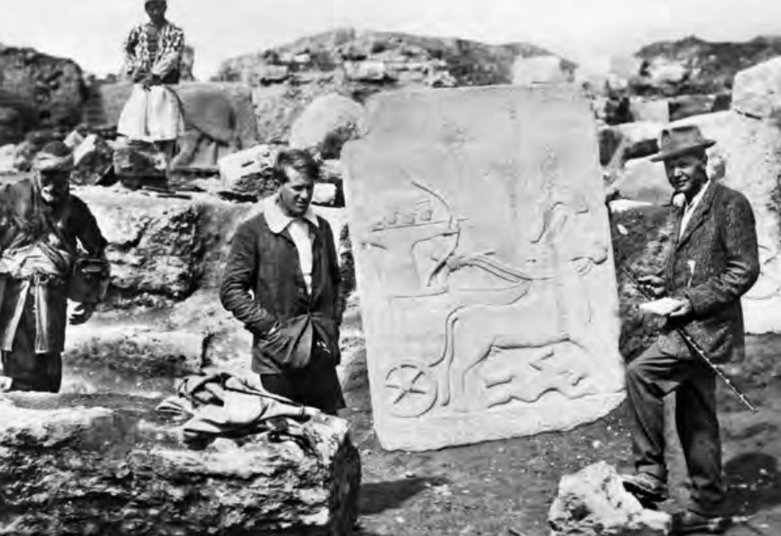
T.E. Lawrence and Leonard Woolley at Carchemish. Between March 1912 and June 1914 Woolley and Lawrence oversaw five seasons of archaeological digs at Carchemish.