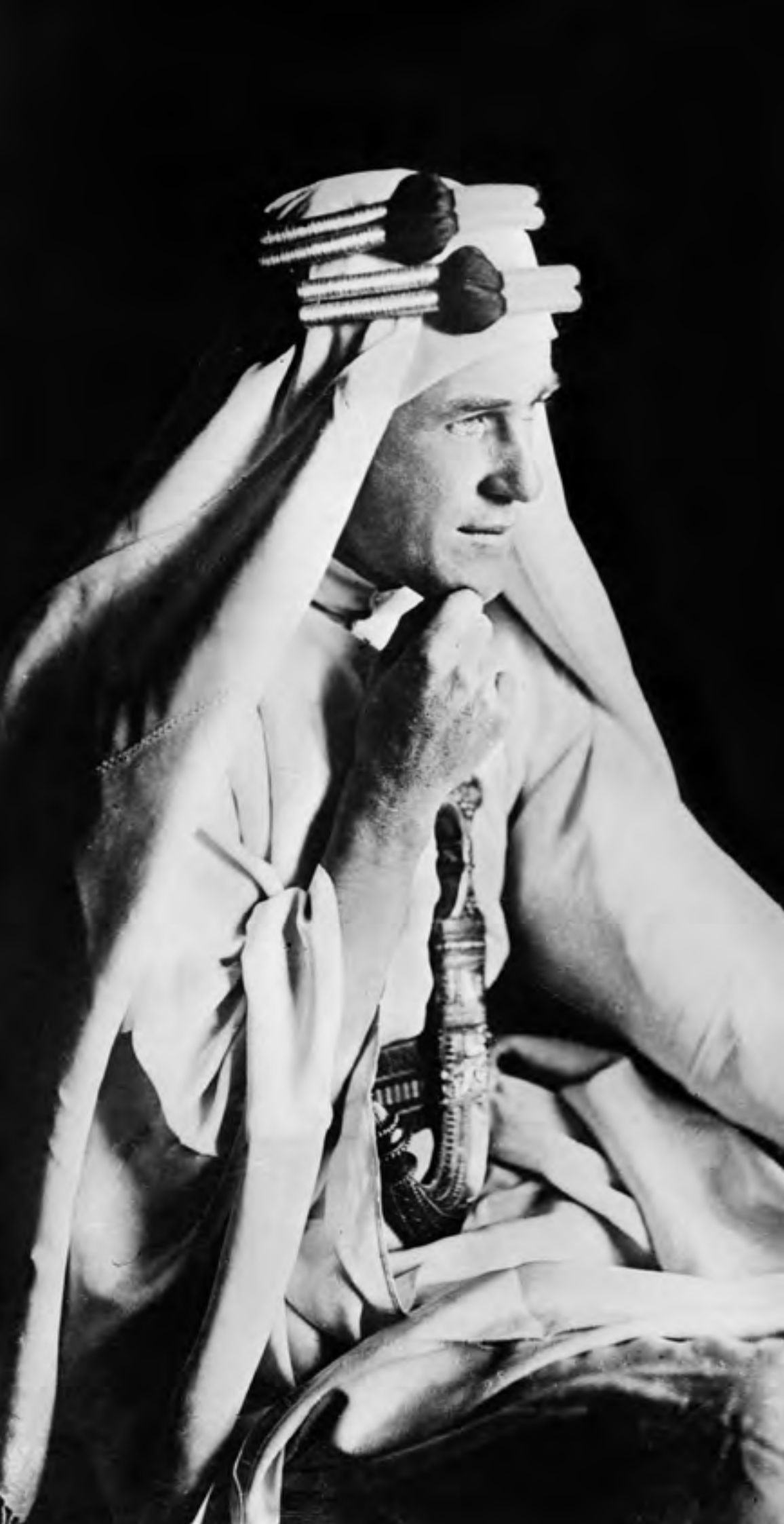
T.E. Lawrence in Arab dress, a portrait by the famous American photographer Harry Chase in 1919.