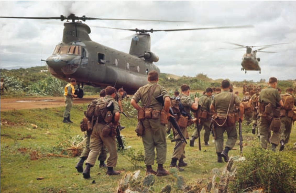
Soldiers of 7RAR about to board US Army Chinook helicopters to return to Nui Dat at the end of Operation Ulmarra, August 1967. EKN/67/0133/VN