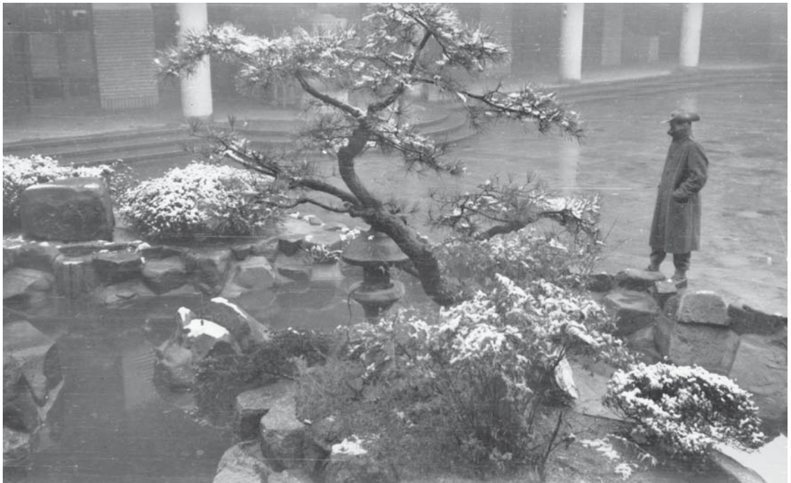
BCOF soldier in a Japanese garden at Kure, March 1946. 129939