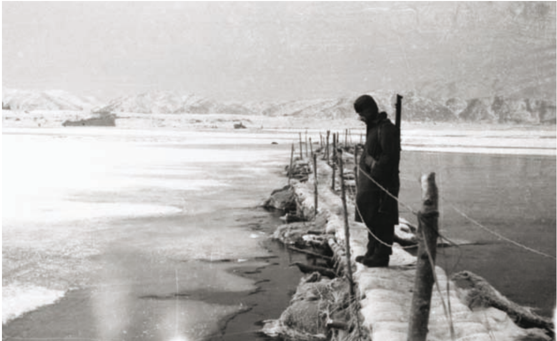
A member of 3RAR stares into the frozen waters of the Han River, Korea, in early 1951. P01813.555