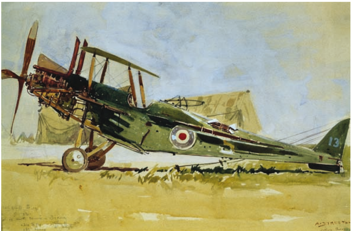
Arthur Streeton, Old S15, struck off strength after ten months' service (1918, watercolour and gouache with pencil on paper, 37.4 x 55.5 cm, ART03508)