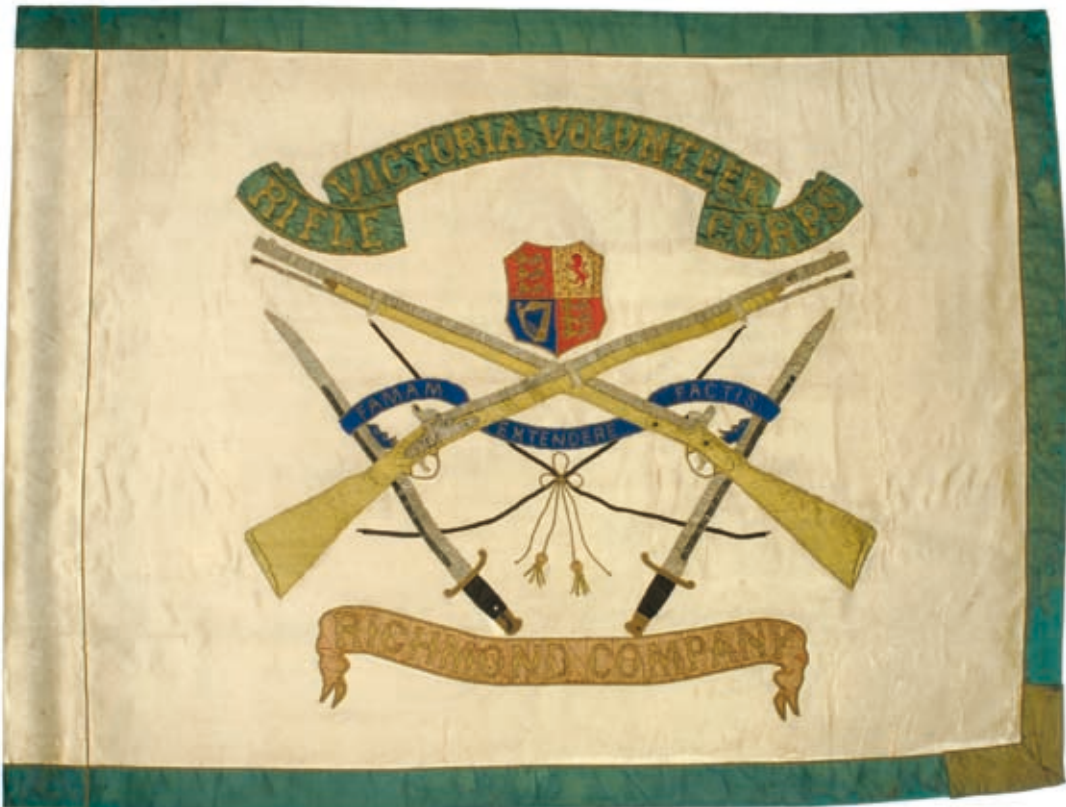
Regimental Colour of the Richmond Company, Victorian Volunteer Rifle Corps. RELAWM17162.001