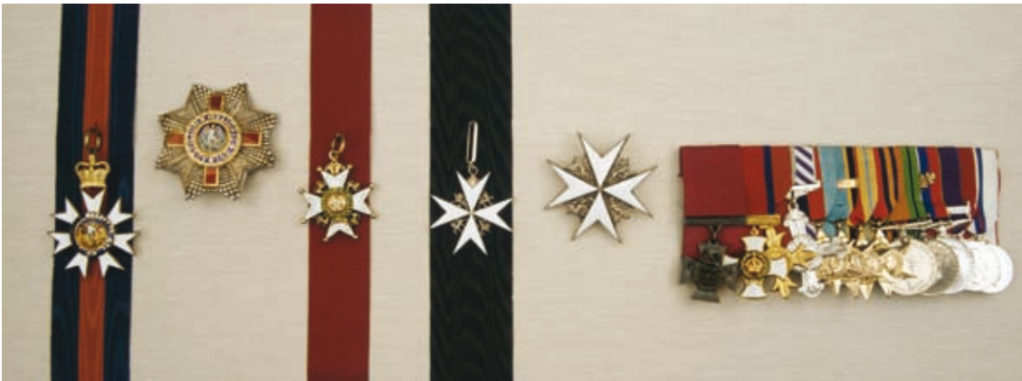
The medal series of Wing Commander Sir Hughie Edwards VC KCMG CB DSO OBE DFC on display in the Hall of Valour. REL/08999