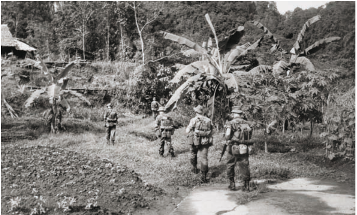
Soldiers of 4RAR on patrol during a Claret operation in Borneo, c. 1966. P04994.018