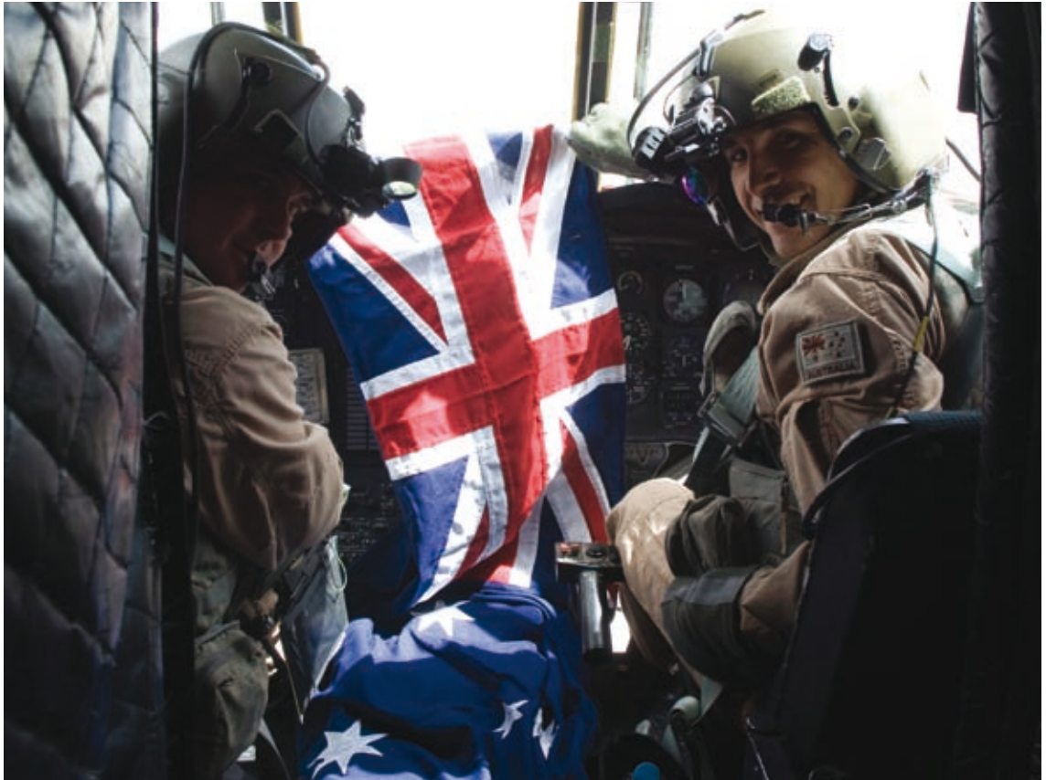
Australian Chinook helicopter pilots in Afghanistan, 2007. P05730.498