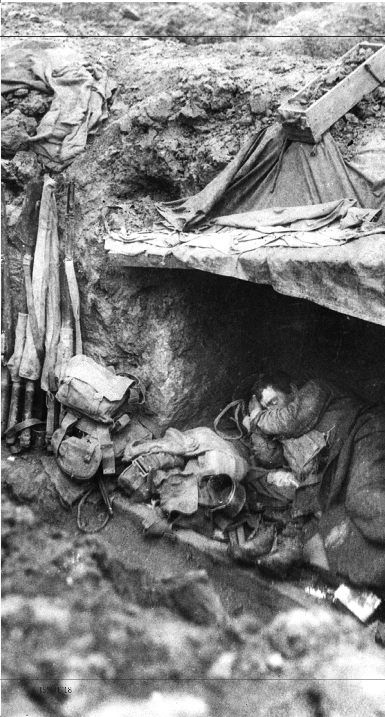
Left: A revealing study of the squalid condition of First World War trenches. An Australian sleeps in a trench shelter in the second line of trenches before Riencourt.