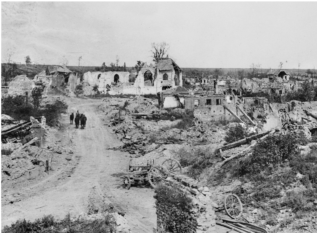
Above: War-damaged Quéant, France, in 1918.

Facing page: A small section of barbed wire in front of the Hindenburg Line at Quéant.