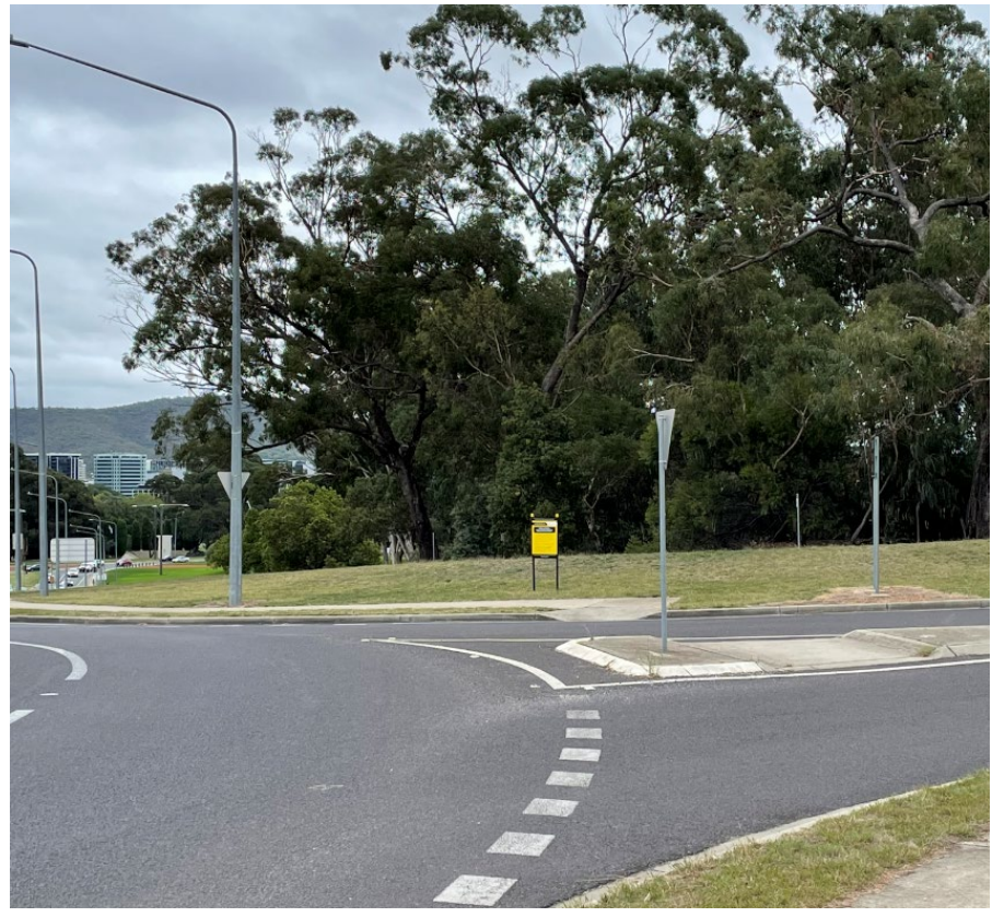
Figure 5: Site Notice – Sign 2 (Adjacent to the footpath at the Treloar Crescent and Limestone Avenue Intersection)