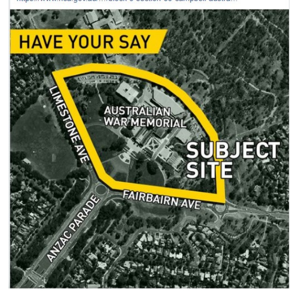
Figure 3: Facebook Post