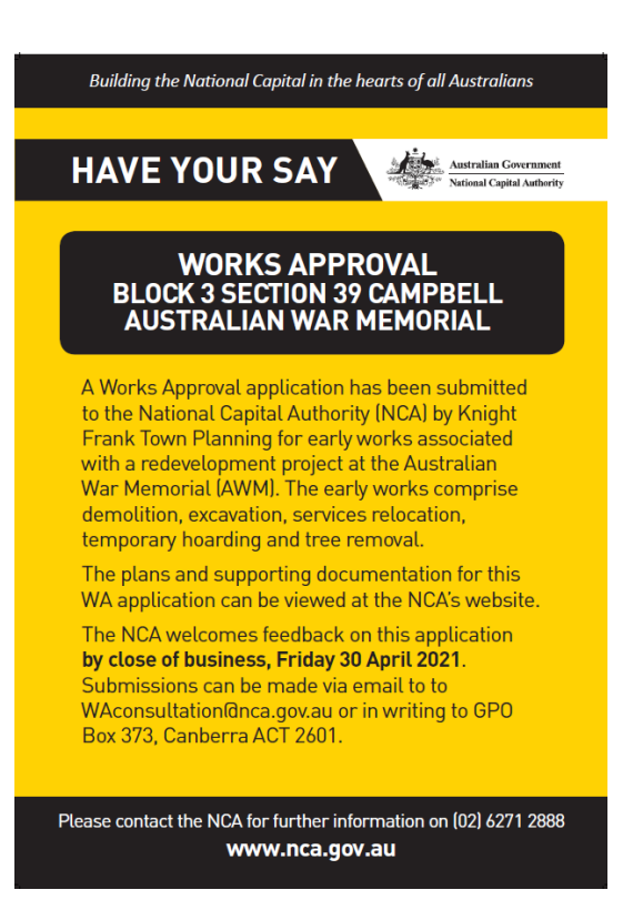
Figure 2: Site Notice