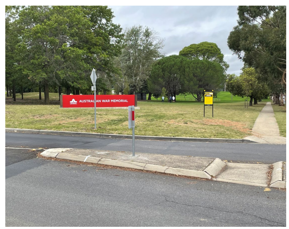
Figure 4: Site Notice – Sign 1 (Adjacent to the footpath at the Treloar Crescent and Fairbairn Avenue intersection)