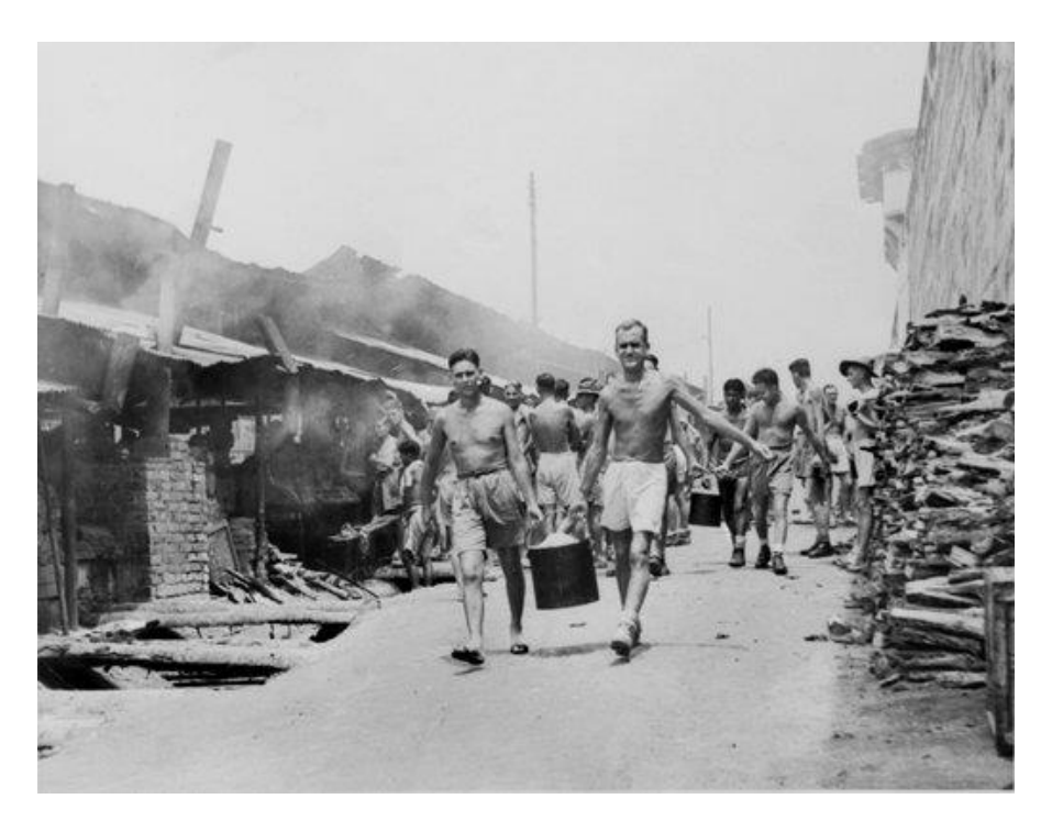
Image 1: Australian prisoners of war carry a ration of rice that had to feed 250 men, September 1945. (AWM 019192)

The majority of crimes in Changi were far less malicious than this example, and many prisoners of war stole to feed themselves and their friends.