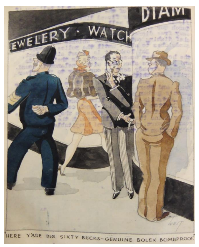
Image 2: A cartoon from the January 1945 edition of Smoke-Oh magazine, which depicts the black market activities as if they were happening on the home front. The sales approach appears unnatural in the home front context, but records indicate that hawking and the manufacture of fake products were common practices in Changi. (AWM 3DRL/5040.001)

The black market allowed the prisoners of war to trade among themselves, but it also allowed them to trade with the various Japanese, Korean and Indian camp guards. The camp guards had large sums of local currency and were willing to trade for luxury goods. Once this became common knowledge in the camp, fountain pens were suddenly engraved with the "Parker" brand on their sides and sold to the guards for inflated prices. Likewise, broken Rolex Oyster wrist–watches had the parts removed and replaced with inferior parts, and sold at high profits to the guards. 46