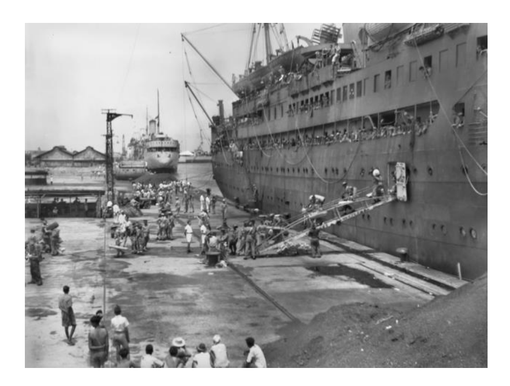
Members of the 2nd Australian Prisoner of War Reception Group disembark from the MV Duntroon in Singapore, 13 September 1945.