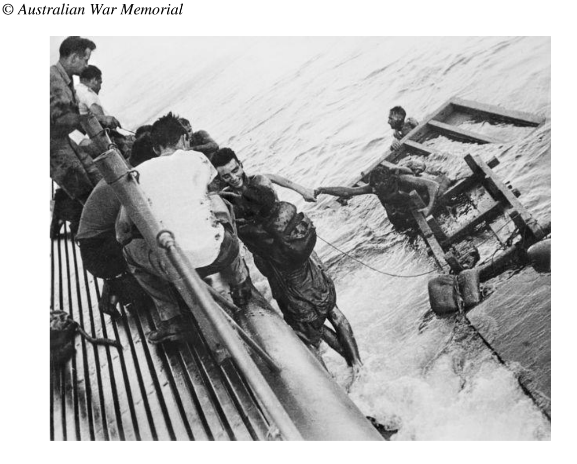
The submarine USS Sealion recovers British and Australian survivors of the sinking of the Rakuyo Maru, 15 September 1944.

After a period of hospitalisation and recovery, the survivors were sent to army headquarters in Melbourne in February 1945.<sup>46</sup> They spent two months recounting their experiences, the conditions of fellow prisoners, locations of camps, and allegations of war crimes.<sup>47</sup> The men were the first to provide an authentic account of imprisonment under the Japanese, as well as details of the now infamous Burma–Thailand Railway.<sup>48</sup> This information formed the basis for the extensive planning of prisoner-of-war recovery throughout 1945.