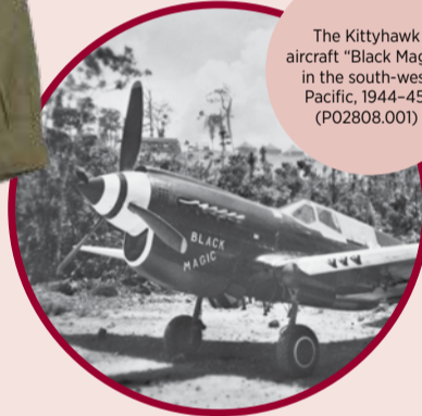
The Kittyhawk aircraft "Black Magic" in the south-west Pacific, 1944-45. (P02808.001)

At least four known Aboriginal pilots and aircrew participated in missions as members of the Royal Australian Air Force during the Second World War. These men flew a diverse mix of aircraft over the Mediterranean, Pacific, and European theatres of war. This special NAIDOC Week presentation will take a look at each member, the aircraft they flew, and what became of them.