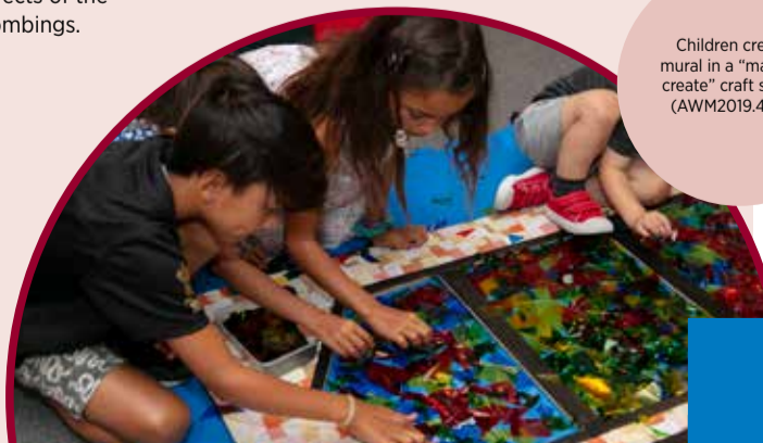
Children create a mural in a "make and create" craft session. (AWM2019.4.25.6)

Children and their families are invited to join the Education team for a free craft session. Craft activities will focus on connections to Aboriginal and Torres Strait Islander service.