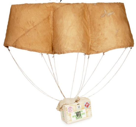
Image 2: Ammunition parachute used by No. 9 Squadron, Royal Air Force (AWM RELAWM11629)

their assault. Carrying one box of SAA would typically take two runners, who would be required to negotiate treacherous terrain under machine-gun and artillery fire as they made their way through no man's land. Wackett's design involved making parachutes from aeroplane fabric and tying it through the handles of SAA boxes (see Image 2).<sup>33</sup> The rolled parachutes would then be stored in half oil drums in the bomb rack of RE8 reconnaissance aircraft.<sup>34</sup> The premise was that the parachutes would reduce the impact of landing and increase the chance of SAA being delivered undamaged.<sup>35</sup> Preliminary experiments determined that these boxes could be dropped from a height of approximately 300 metres, landing within 90 metres of the target. While Wackett was not immediately informed of the intent of this invention, Rawlinson and Monash attended a demonstration of this tactic on 24 June 1918, and it was determined that the technique would be used in future operations.<sup>36</sup> The two commanders wanted to introduce these innovations into battle and test their effectiveness in achieving mobility and reducing casualties.<sup>37</sup>