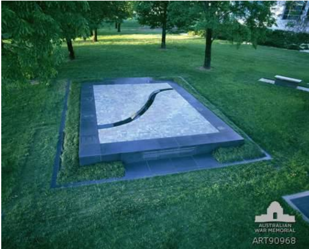
Anne Ferguson, Australian servicewomen's memorial (1999, sculpture, 40.3 x 540 x 720 cm) ART90968

Anne Ferguson created a platform of earth-coloured tiles. It is divided by a curved trench to suggest a river, carving its way through a sparse, flat landscape. It invites the viewer into the work and to experience a sense of empathy with the women it commemorates. The insignia of the different women's services are displayed subtly on the black tiles around the mosaic.