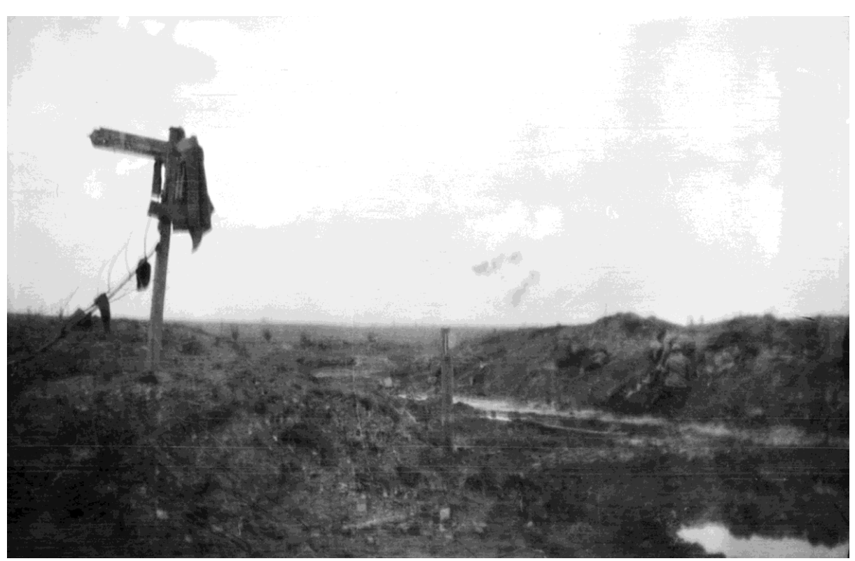
Image 5: View of the road behind battalion headquarters at Seine House.

Brigade. This was exacerbated by poor communications and command inexperience in the field.