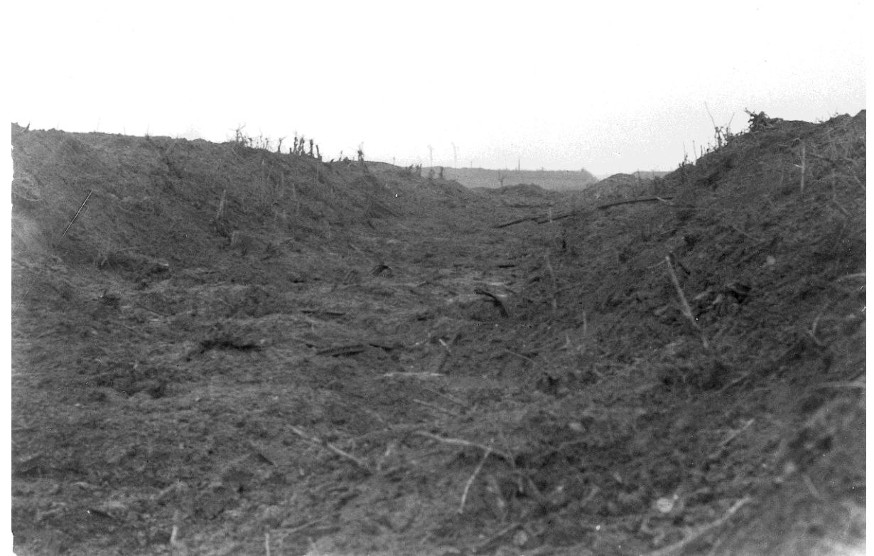
Image 1: The Defy Crossing, a cutting where the Ypres–Roulers railway once crossed the Zonnebeke–Passchendaele road, marked the limit of the Australian advance on 12 October 1917. (AWM E01165)

Casualties were exceptionally high, particularly among officers, who suffered a 70 per cent casualty rate.<sup>14</sup>