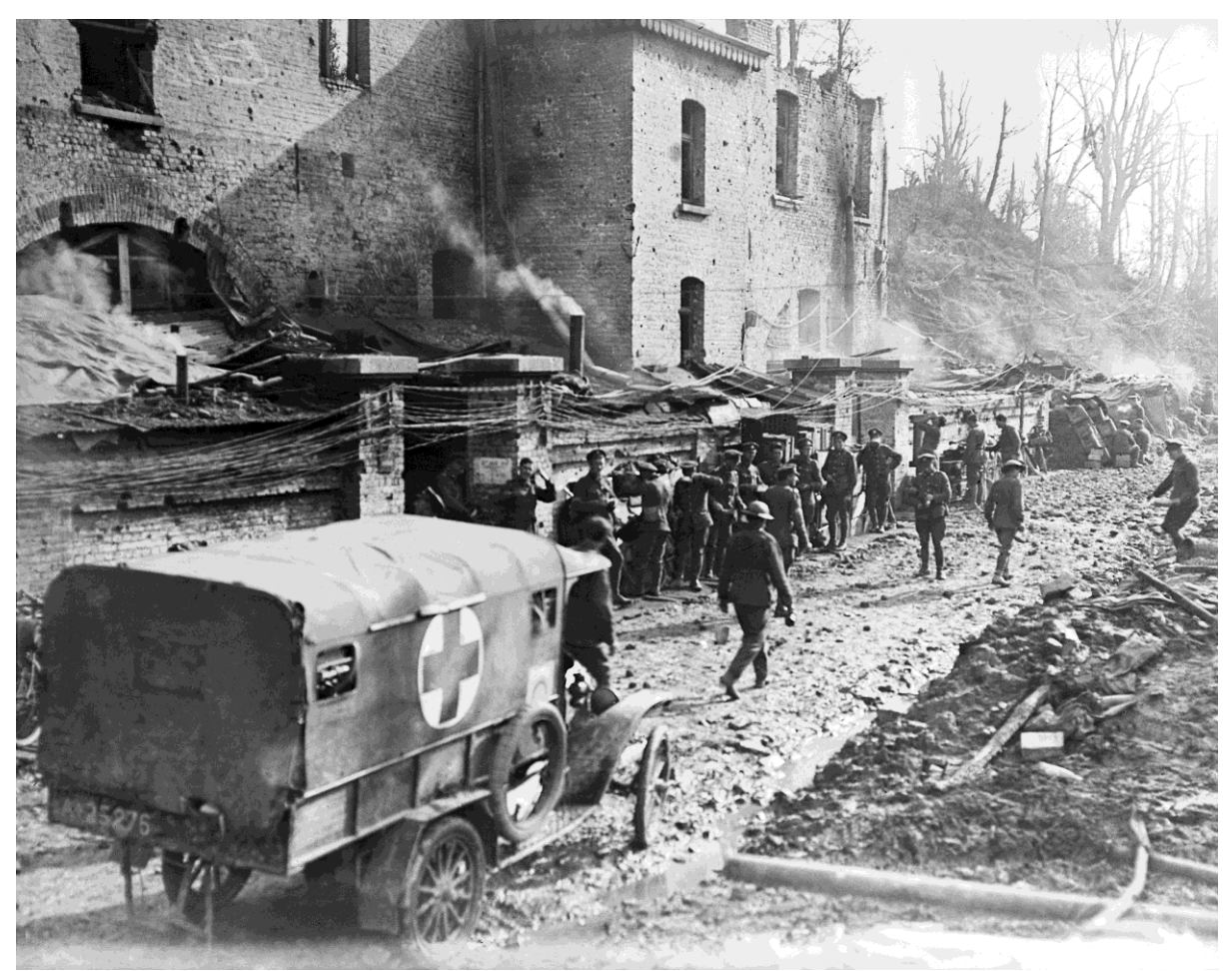
Image 3: The 3rd Division headquarters in the ramparts at Ypres during the Broodseinde and First Passchendaele operations.

committed without first referring to me".<sup>53</sup> This countered official guidance recommending that: