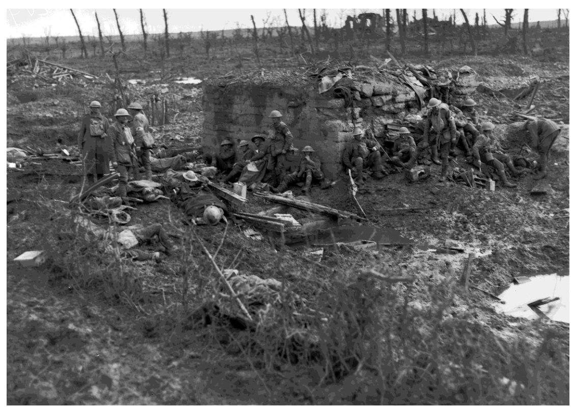
Image 7: Stretcher-bearers resting behind a pillbox near Zonnebeke, while bringing back men wounded on 12 October 1917.

Bad weather and a lack of tracks hindered the ability of the medical services to clear the battlefield. Furthermore, the stretcher-bearers had already been at work on the battlefield since early the previous day when, for 24 hours from 6 am on 11 October, 123 stretchers were carried out of the front line – 87 of these were men of the 66th Division. This had the effect of "completely tiring" the ambulance bearers before the commencement of the attack on 12 October by the 3rd Division.<sup>110</sup> Casualties among medical personnel were particularly high. One doctor, wounded in the neck at First Passchendaele, gave a horrific account of how "750 men went over the top and less than 50 came back".<sup>111</sup>