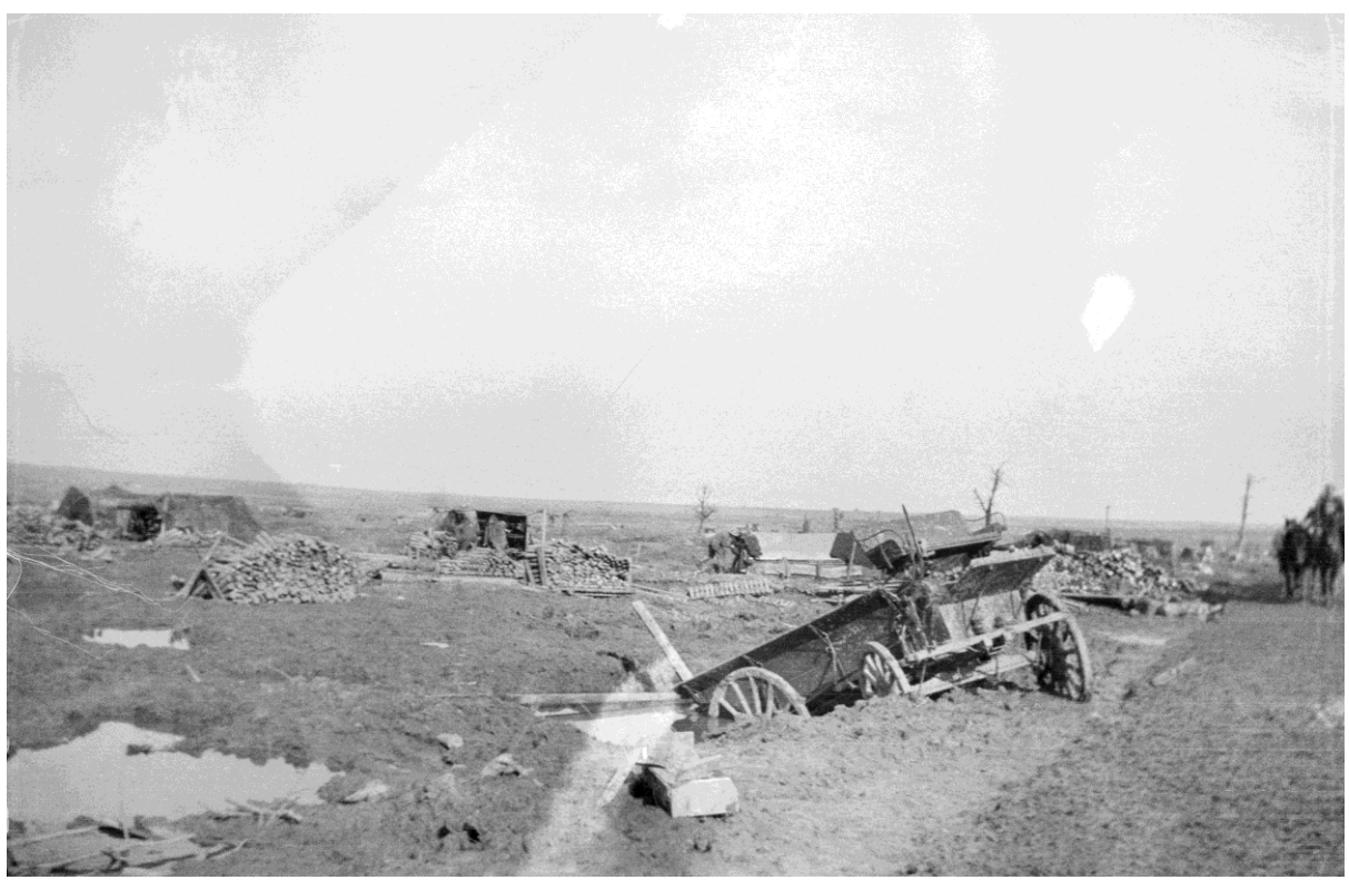
Image 6: A wagon bogged in a shell hole near Zonnebeke. Note the gun emplacements and dumps of 18-pounder shells in the background. (AWM E01048)

Australian War Memorial, SVSS paper, 2011 Aimée Fox, The performance of the 9th Brigade, AIF, at First Passchendaele © Australian War Memorial