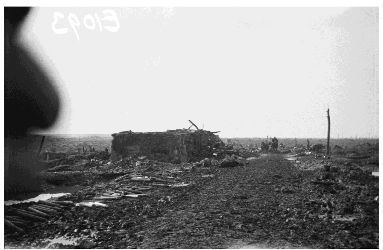
Image 4: 9th Brigade Headquarters on 12 October 1917.

forward zone.<sup>62</sup> There was a general lack of consistency from GHQ as to whether brigade commanders should go forward and lead or stay back and command during operations. One pamphlet stated that brigade headquarters "must be practiced in moving forward during the progress of an attack"<sup>63</sup>, whilst another suggested that brigades should "move as seldom as possible'"<sup>64</sup> The latter went on to state that they "should not be situated so close to the fight that brigadiers and their headquarters become involved in the firing line".<sup>65</sup> Inconsistent doctrine and top-heavy micromanagement served to create a limiting effect on brigade performance.