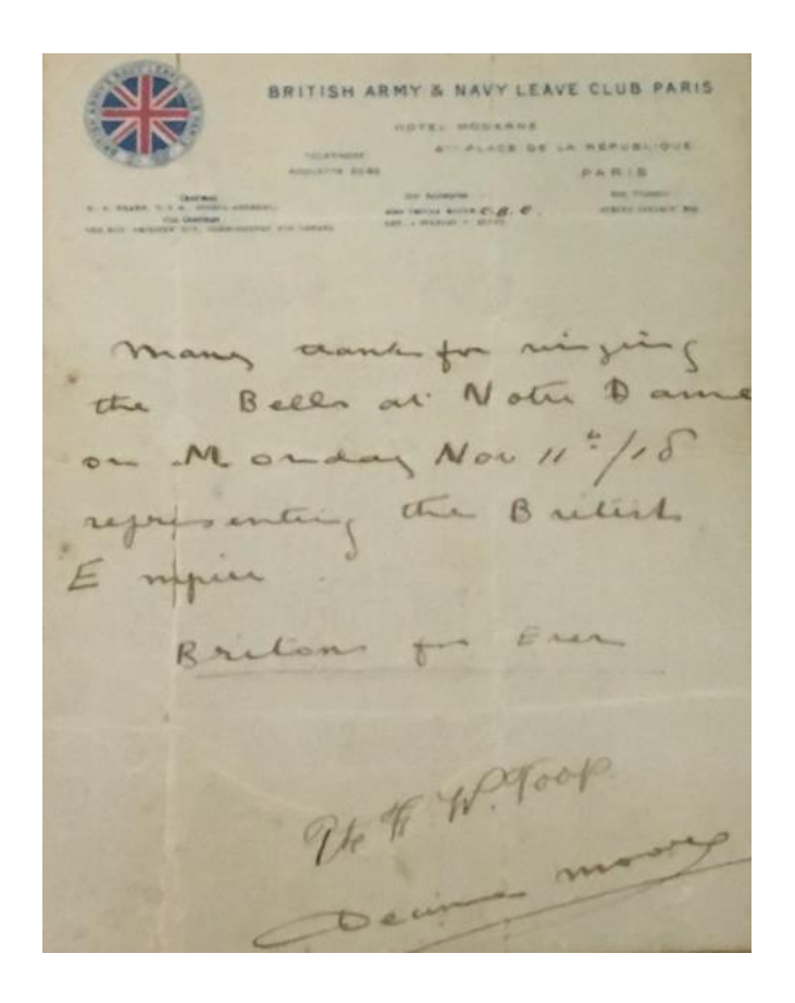
Figure 8: A letter from the British Consul to Private Toop.

After months of brutal fighting on the Western Front, the Allies finally broke through the Hindenburg Line on 29 September 1918. The Allies had defeated the German army and within weeks came the Armistice. The Armistice of Compiègne between the Allies and Germany came into effect at 11am on 11 November 1918. The battlefields were silent on the Western Front and after more than four years of horror the war was finally over.