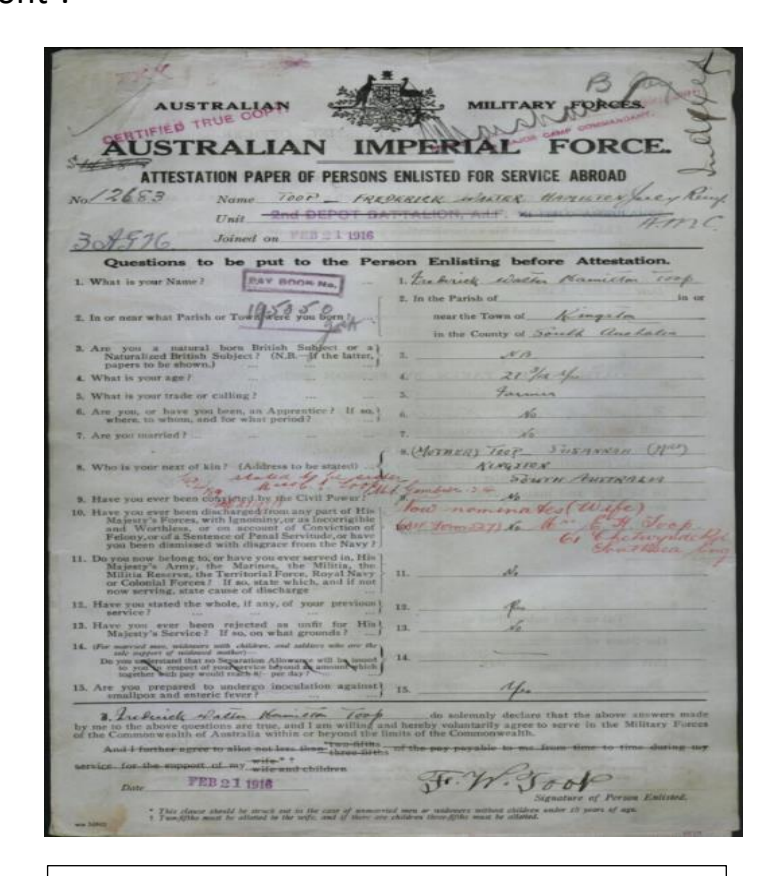
Figure 2: Toop's enlistment papers.

Britain declared war on Germany on August 4, 1914, after the Germans invaded Belgium. Australia was still a young country with a population of only 4.5 million, but was extremely loyal to the British Commonwealth<sup>3</sup>. Australia deployed some 416,000 men into battlefields around Europe, which represented a staggering 38.7% of the total adult male population<sup>4</sup>. Tiny Toop was initially denied for active duty in the Australian Imperial Force as he did not pass the physical testing, but was deployed to the Western Front on February 21, 1916 (see Figure 2)<sup>5</sup>. Toop was 21 ¾ years of age and 6 foot 4 inches in height when he was deployed to the Western Front<sup>6</sup>.